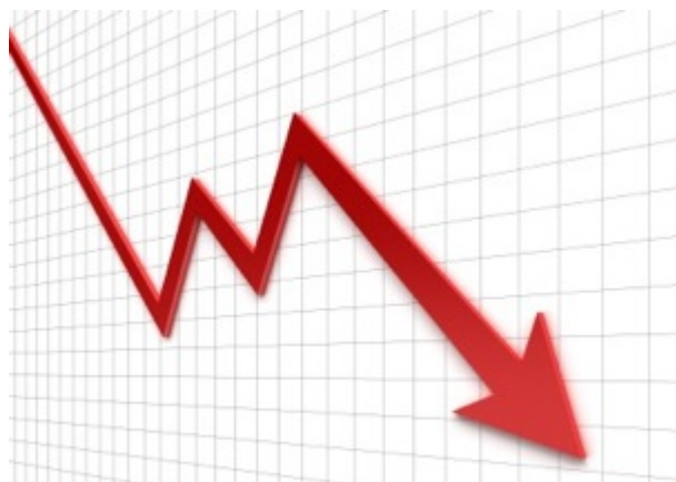
Crime has dropped dramatically in several cities, despite the recession.

W ith the economy in recession, one could hardly expect crime rates to go down. However, that is just what is happening in some big cities.